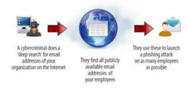
Figure: 4 Shows the Bad Guys Attack

Drive-By Downloads: When the user visits a webpage without the user permission it can automatically download an application and execute the threads to the user.