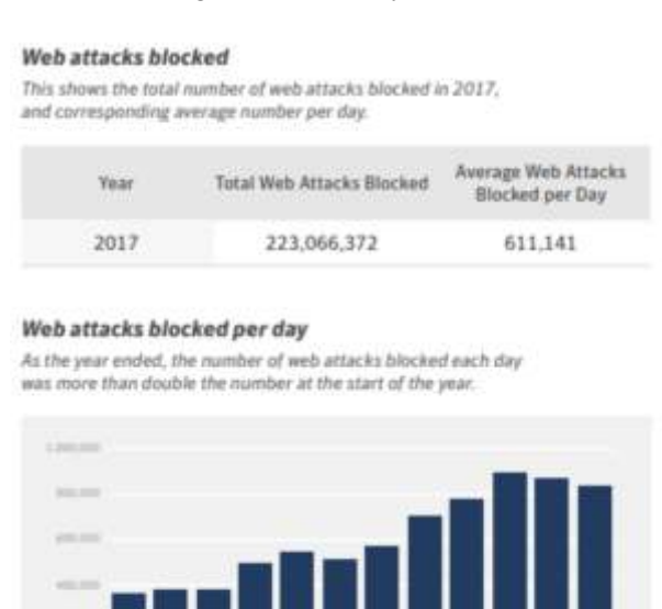
Figure: 3 Web Attacked Blocked in 2017

In this case the user is continuously connected to internet and regularly accesses web-based services, [7]. Website-based threads create persistent issues for mobile devices: Figure 3 shows the website-based attacks' blocking details for the year 2017.