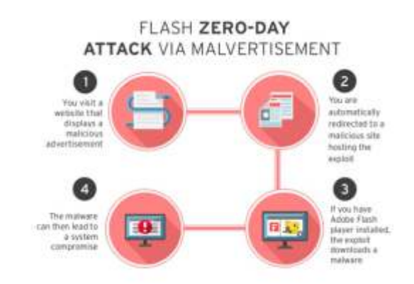
Figure: 1 Shows the Flash Zero Day Attack

These threads [4] would try to collect or use private data without the user's knowledge. The data commonly targeted by spyware include phone call history, email, location, private photos and browser history. The stolen information could be used for identity theft or financial fraud. Figure 1 shows the attack via malver-tisement in four steps.