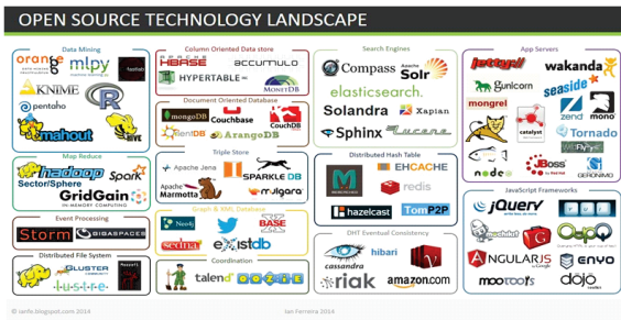
Figure 2: Open source technologies

People cannot make money with open source unless it gets famous or popular. But we can make money with open source by providing Add-Ons and Support by making those are pricing. People should know that Many Open Source Companies are having their open-source version and Business Version of the Software so that they can choose the free version for Normal use and Paid version for some particular purpose. It doesn't mean that the scope of activities done by open source is unlimited. Similar to any commercial version software, there is always a limitation on the activities which can be done by open source softwares. There are many free add-ons[5] support for open source (Not All companies are having both open and commercial version of the product, few companies have their product as a commercial version for some advanced use).