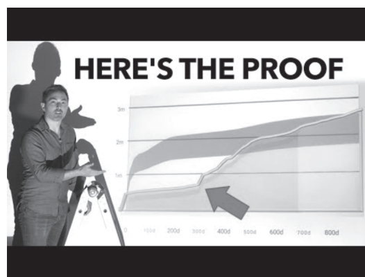
Figure 1: Example of Clickbait [8]

searching a relevant content simply attract towards a thumbnail view or the catchy phrase of a video or post. This encouraged people to read a lot of erroneous and deceptive material